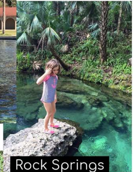
Rock Springs (p2)