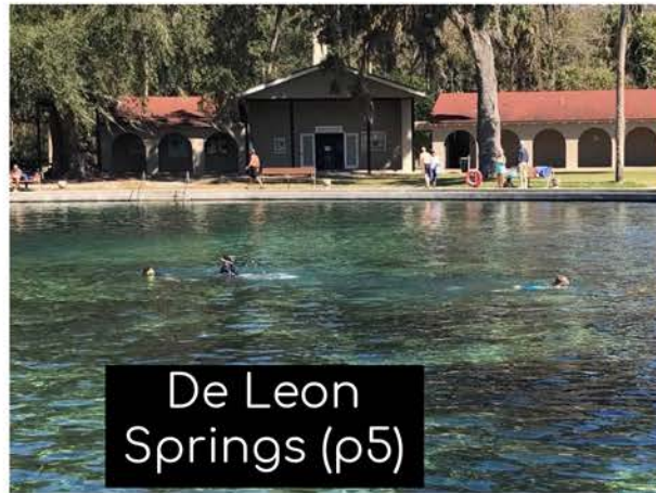
De Leon Springs (p5)