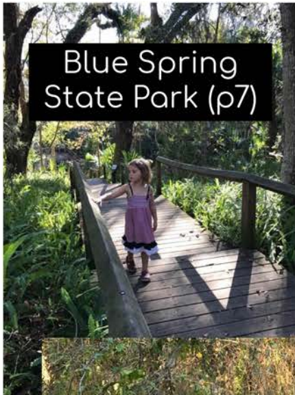
Blue Spring State Park (p7)

In my experience, our low cost memories are some of our best memories. There are no expectations when it only costs a few dollars to go to a state park for a day, for instance. These simple nature moments we've experienced as a family in the Orlando, Florida area have been some of our best and most memorable! These 10+ locations have provided a hearty amount of activities for a weeks worth vacation. Often the kids want to return so these spots could last you a several week Orland stay. Enjoy your adventures!